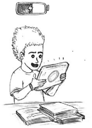
If it runs low level programs like playing games it can keep going.